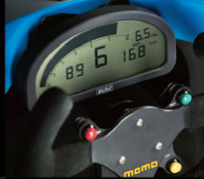
MoTeC engine management and ADL data acquisition system