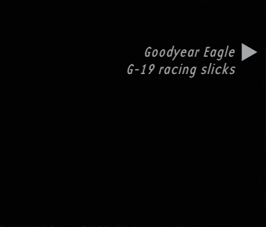
Goodyear Eagle G-19 racing slicks