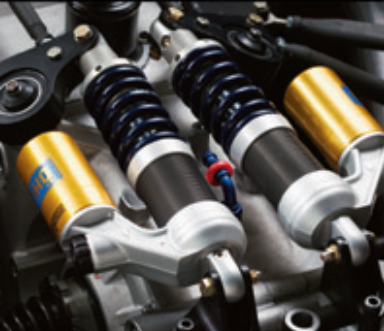
Pushrod suspension with double-adjustable Ohlins racing shocks